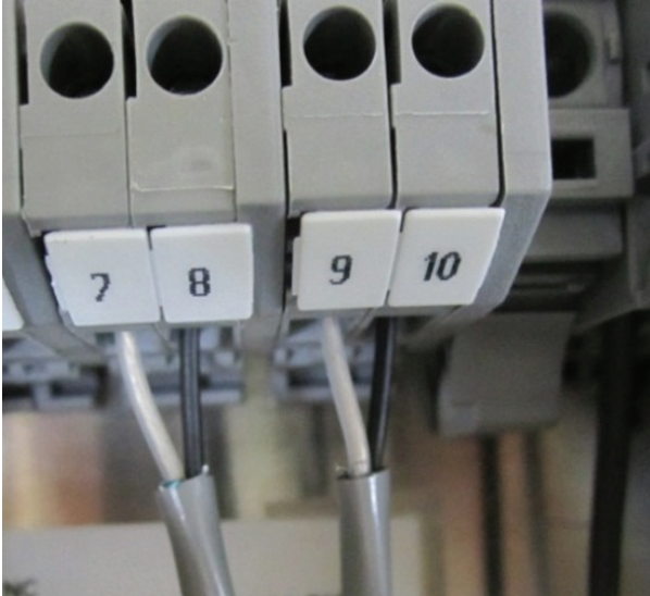
1) RS485 connection

Two wire RS485 connection to host system at terminal blocks 9 ( + ) and 10 ( - ) in the TT-TS12-PANEL-xx versions